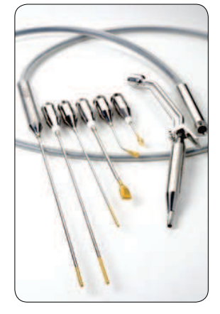
Phlebological cryoprobes for cryostripping, varicose veins

Both modes are fully automatic and do not require user intervention. Device using texts on the screen and voice communicates informs about preparation to the procedure or beginning and end of the cleaning. Innovative solution for cryoprobe cleaning guarantees safety and high effectiveness of the procedure.