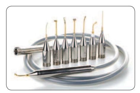
Ophtalmological cryoprobes for retina, glaucoma, cataract, eyelash