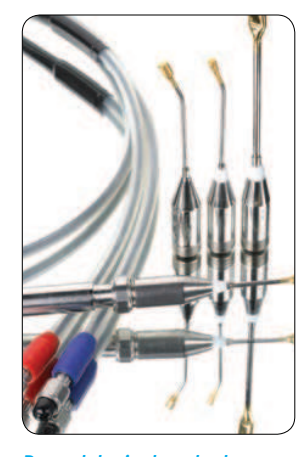
Dermatological contact cryoprobes