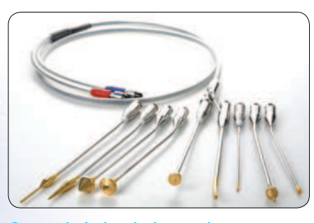
Gynaecological contact cryoprobes for cervical, canal, cysts, endometrium freezing

Laryngological cryoprobes for tonsilectomy, adenotomy, detrit stasis, tonsillectomy