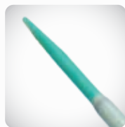
Radiopaque band available