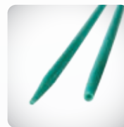
.018" dilator vs .038" dilator

GALT's Micro-Access ELITE HV™ Hemostasis Valve Introducer Kits provide the high quality expected for use during Cardiac Cath Lab and interventional procedures. They are specially designed to provide consistent performance every time.